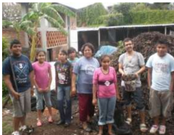
CCIDD'S Environmental Education outreach to La Estacion kids held at Compost Centre in Jiutepec

The Centre composts organic waste and makes compost soil for gardening and for sale at very reasonable prices. There are a variety of useful medicinal herbs grown here as well. They also conduct education efforts at times to encourage families, schoolchildren and groups to compost. Composting is a way of reducing the amount of soil, water and air pollution and ensuring that nutrients are returned to the soil. In addition the Centre tries to improve life in the neighbourhood in which they are situated through reforestation projects and campaigns to control street dogs.