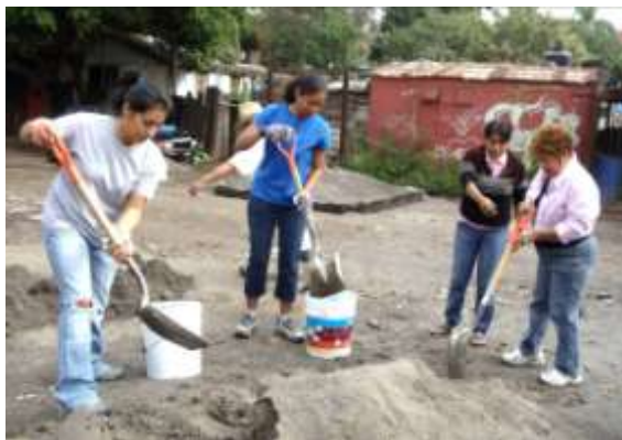
CCIDD employees on the job at La Estacion