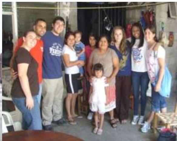
Boston College reaches out to La EstaciónCommunity