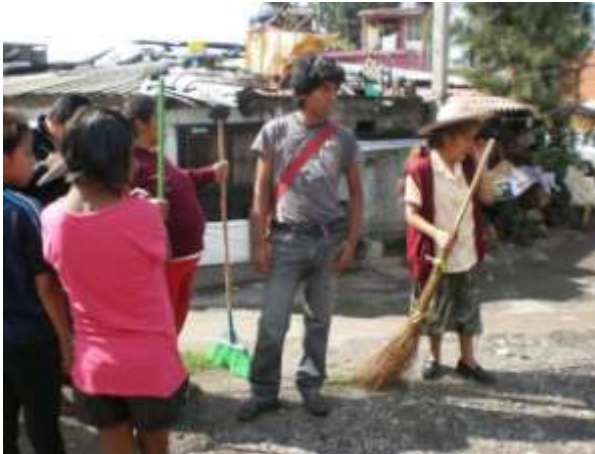
Feast of St. James festivities