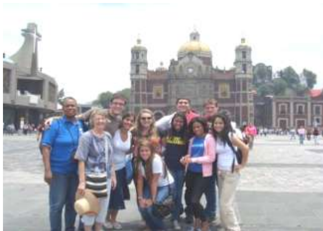
Boston College students at Basilica of Our Lady of Guadalupe

HIGHLIGHTS- ‘ Learning about the Zapatistas and the Peace and Justice and Dignity Movement were the best moments for me because it is a loving movement and we are privileged to be in this country while this movement is taking place’; Boston College participant August 2011