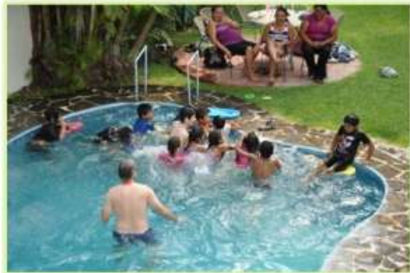
CCIDD pool party