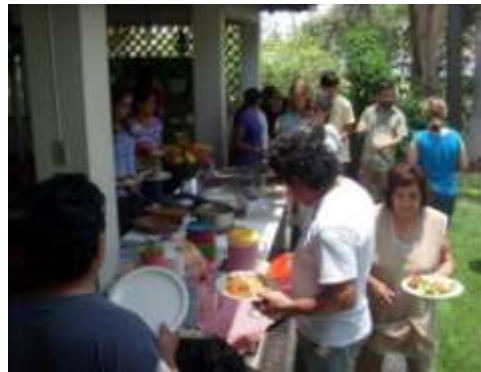
Farewell Lunch for UBC group and CCIDD staff