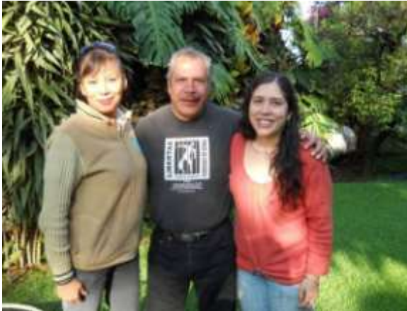
Members of Comite Cerezo at CCIDD