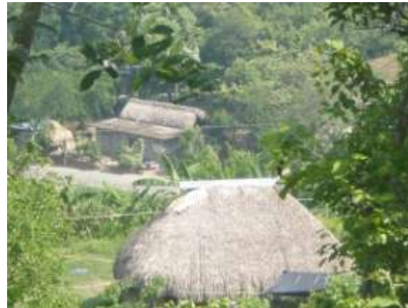
Patnel, San Louis Potosi